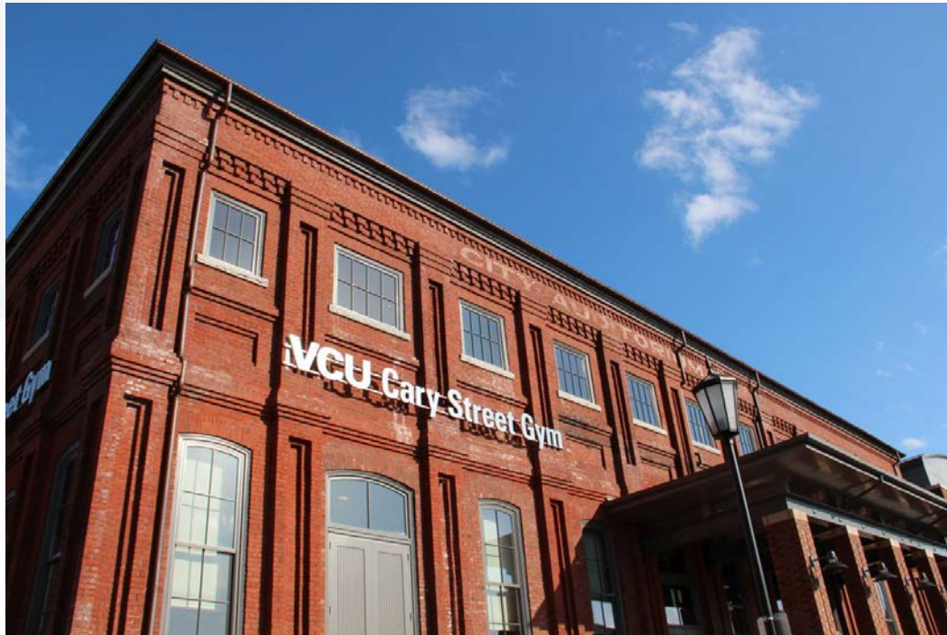
VCU Cary Street Gym